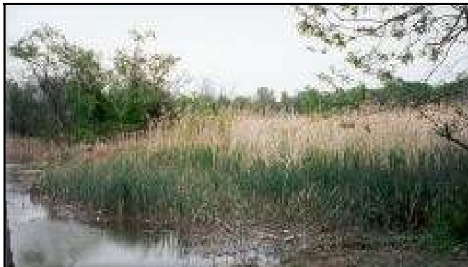
Years later, vegetation at Kingman Lake.