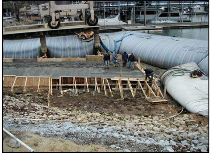
12' high AquaDam® in Chattanooga, TN, along the Tennessee River.