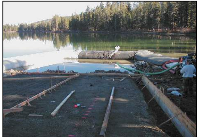
AquaDams® used to dewater for boat ramp construction on Gold Lake, CA.