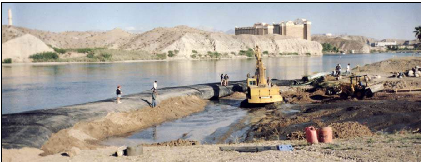
9' high AquaDam® used for boat ramp construction in Bullhead City, CA.