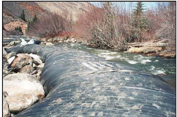
Eagle River. Vail, CO.