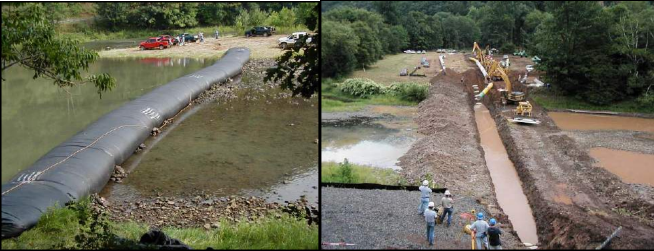
4' high AquaDams® were used upstream and downstream of this trench to contain sediments during a Williams Transco gas pipeline installation in Pine Creek. Williamsport, PA.