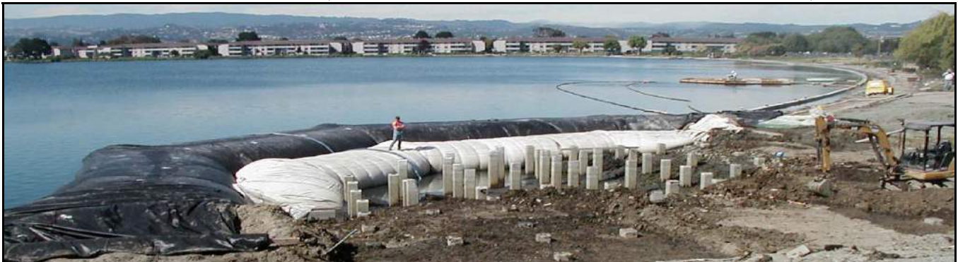
Dewatering for amphitheater construction. Foster City, CA.