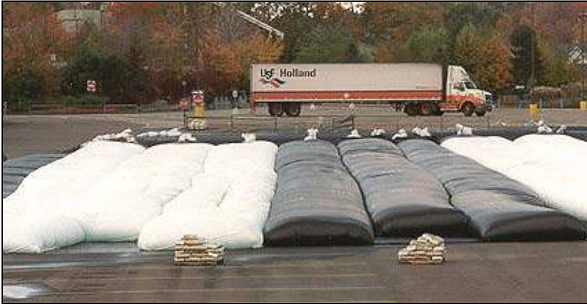
4' and 5' high AquaDams® used for salt water storage during cleaning and renovation of Shamu, the killer whale's tank at SeaWorld Ohio.