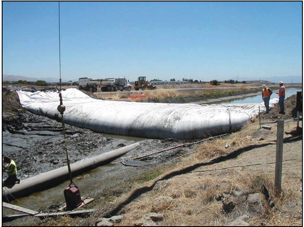
14' high AquaDam® used to dewater a tidal canal in Fremont, CA.