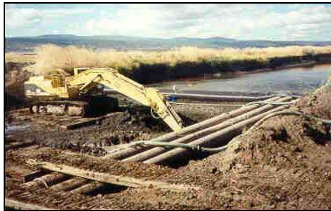
6' high AquaDams in the Pitt River, CA. The river passed through the pipes.