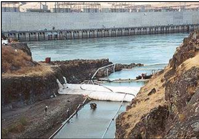
Containing a chemical spill on the Columbia River. The Dalles, OR.