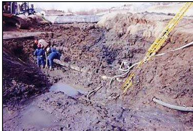
AquaDam® blocks canal in Denver, CO.