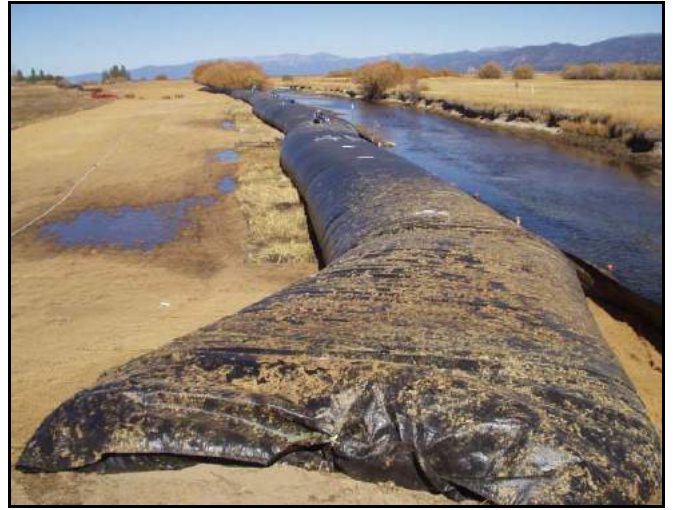
4' high AquaDams® used to separate the Upper Truckee River from newly created wetlands to prevent erosion into Lake Tahoe. Lake Tahoe Keys, CA.