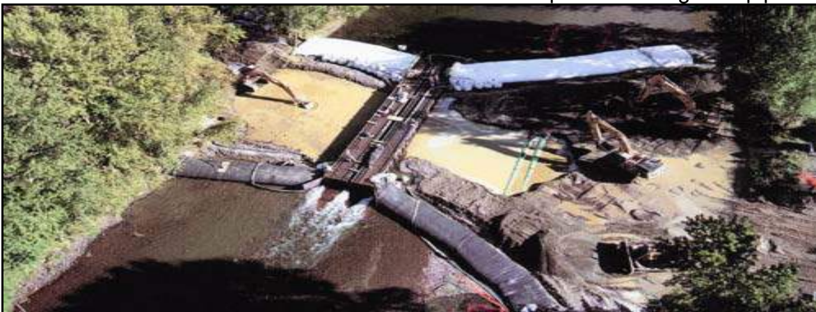
8' and 6' high AquaDams® abut into the sides of a flume near Grand Forks, BC.