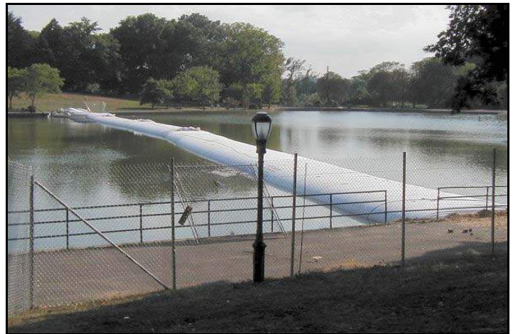
Kissena Lake. Queens, NY.