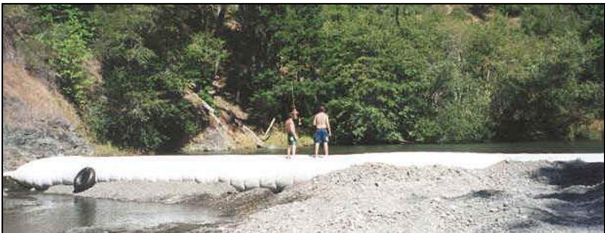
A 5' high AquaDam® installed in Larabee Creek, CA to contain water for a swimming hole.

The end of this AquaDam® was covered with slick plastic to create a giant slip-and-slide.