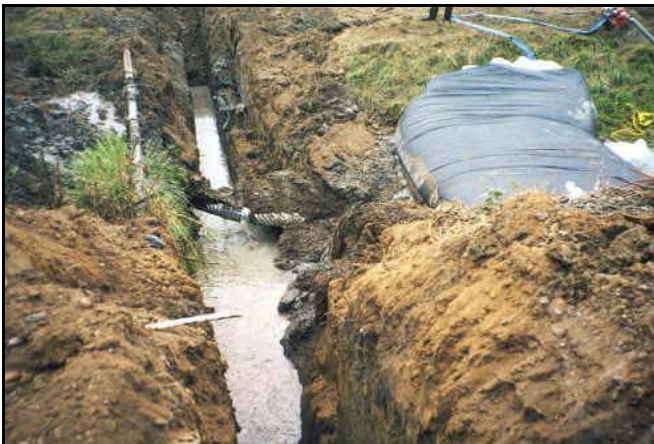
4' high AquaDam® in Eureka, CA.