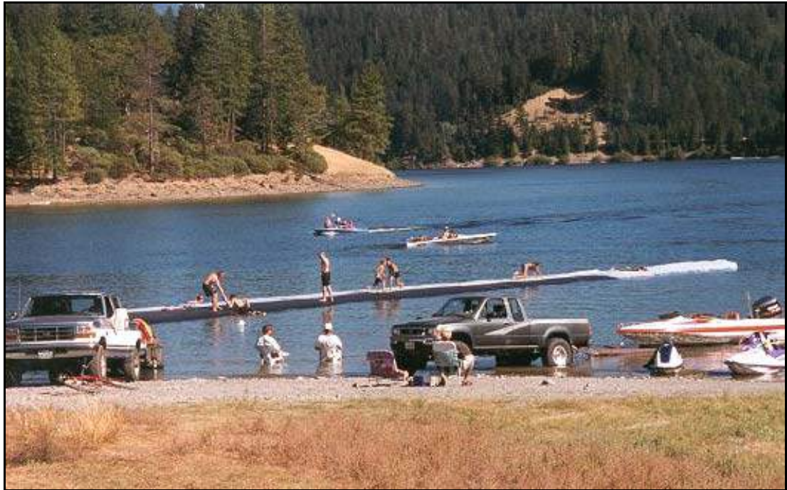
A 6' high AquaDam® installed for recreational use in Ruth Lake, CA.