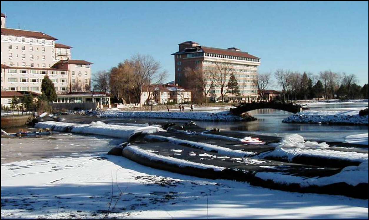
A combination of 8' and 14' high AquaDams® used to isolate and dewater one section of a lake separating two building complexes at the Broadmoor Hotel. Colorado Springs, CO.