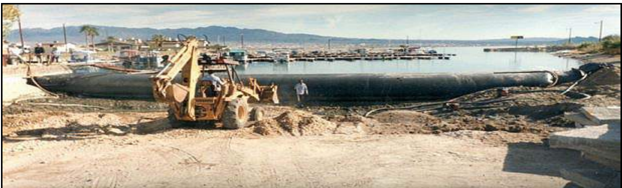
6' high AquaDam® in Lake Havasu, CA, along the Colorado River.