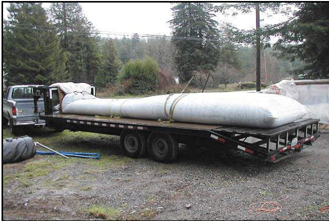
This AquaDam® has been used to convert a flatbed trailer into an instant water tank.