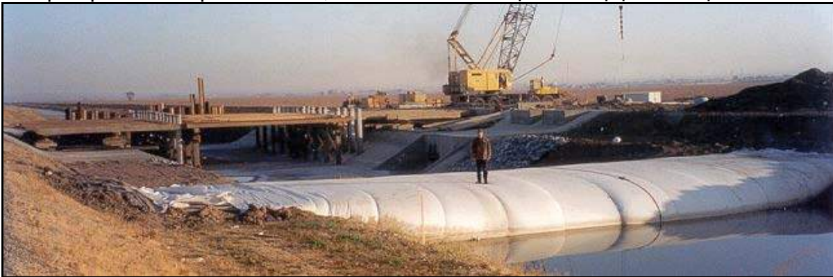
10' high AquaDam® used to dewater for bridge pier construction. Sacramento, CA.