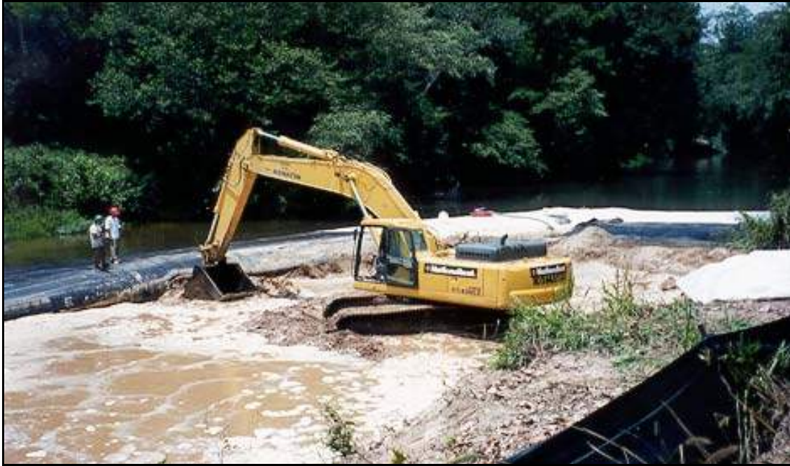
8', 6' and 4' high AquaDams® used to contain sediments during a Williams Transco natural gas pipeline repair project on the Bogue Chitto River. McComb, MS.