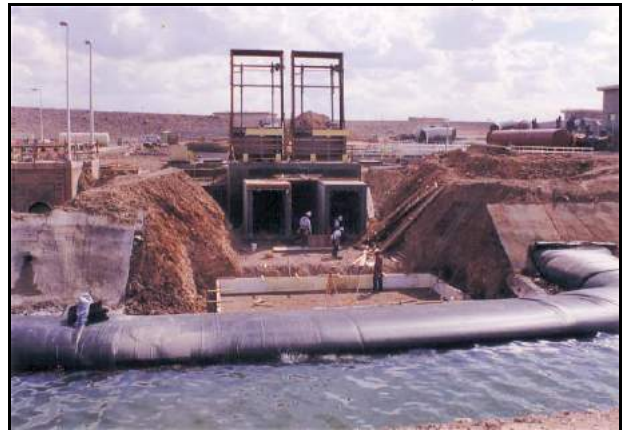
AquaDams® used to dewater a canal bank on the Salt River Project. Phoenix, AZ.