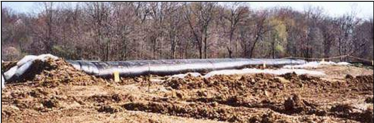
6' high AquaDam® used to store low-level radioactive water for Westinghouse in Northern PA.