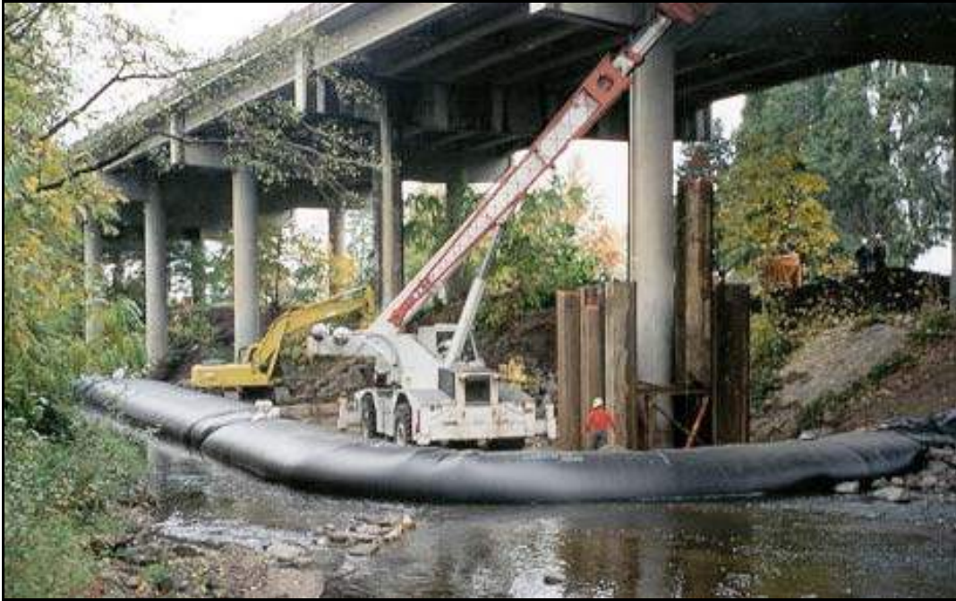
Several 6' high AquaDams® used to dewater a bridge pier for retrofitting in Bear Creek. Medford, OR.