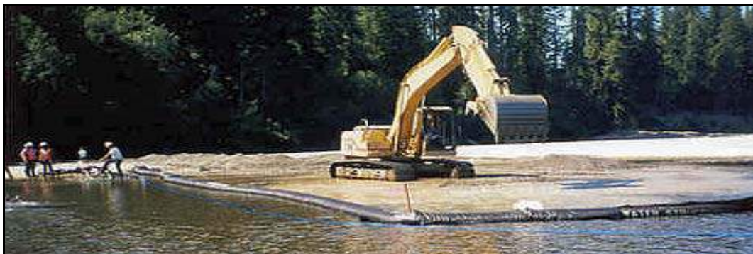
Fish habitat construction on the Eel River. Redcrest, CA.