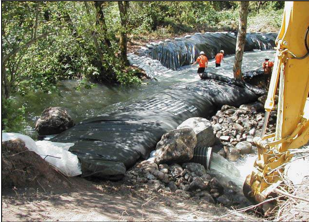
5' high AquaDam® used to divert water for installation of an irrigation check dam in Apple Creek, OR.