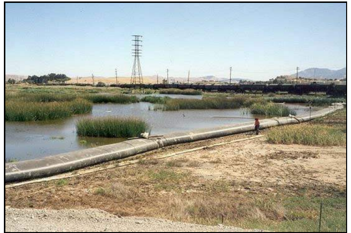
AquaDams® at an oil refinery in Martinez, CA.