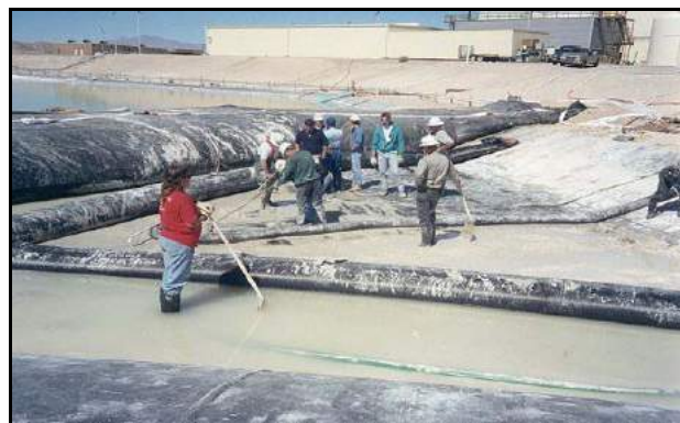
Nevada Cogeneration Associates, Power Plant #1.