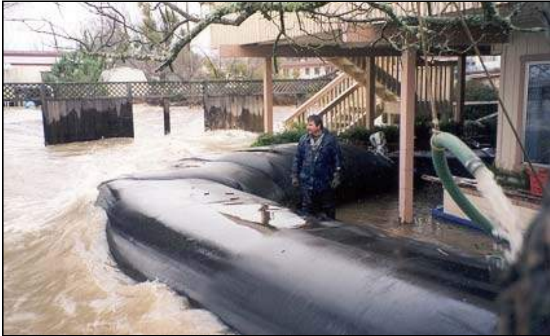
3' high AquaDams® being used for homeowner flood protection in Clear Lake, CA.