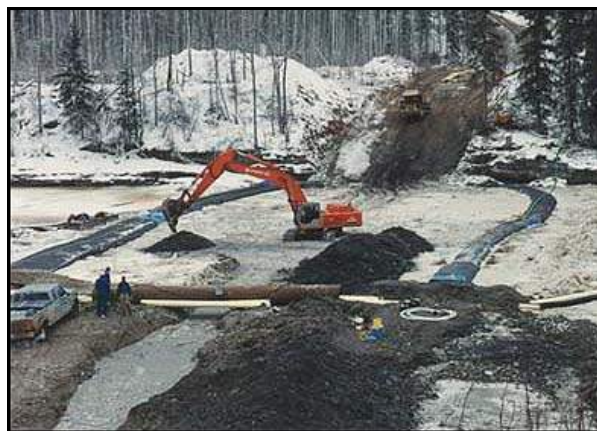
Natural gas pipeline crossings in Alberta, Canada and Fort St. John, B.C.