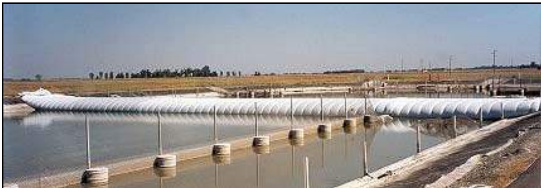
7' high AquaDam® used to split a sanitation pond in Yolo County, CA.