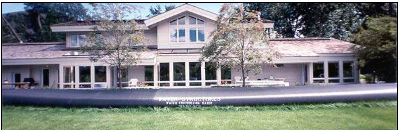
3' high AquaDams® used to protect a home from floodwaters in Sun Valley, ID.