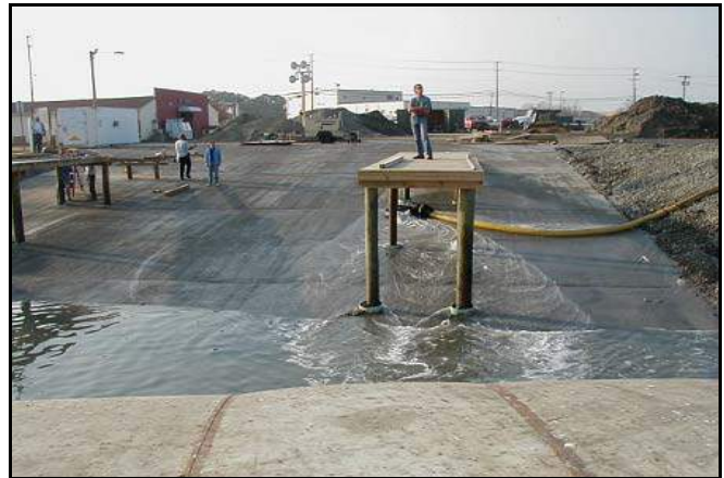
16' high AquaDam® at Little Creek Naval Amphibious Base. Norfolk, VA