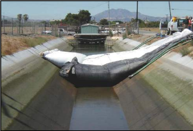
8' and 5' high AquaDams®, used to dewater a canal for pump station repair. Antioch, CA.