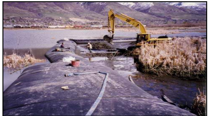
Wetland construction, Great Salt Lake, UT.