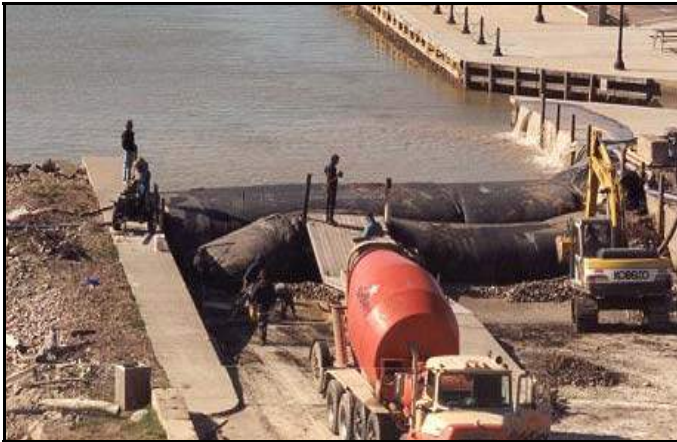
AquaDams®, used to dewater for boat ramp repair on Lake Erie, OH.