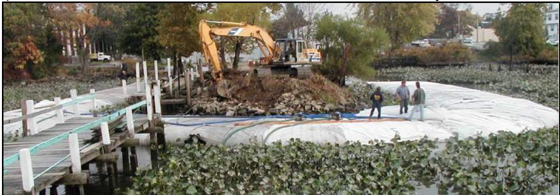
8' high AquaDam® used to isolate a work area for pier construction in Philadelphia, PA.