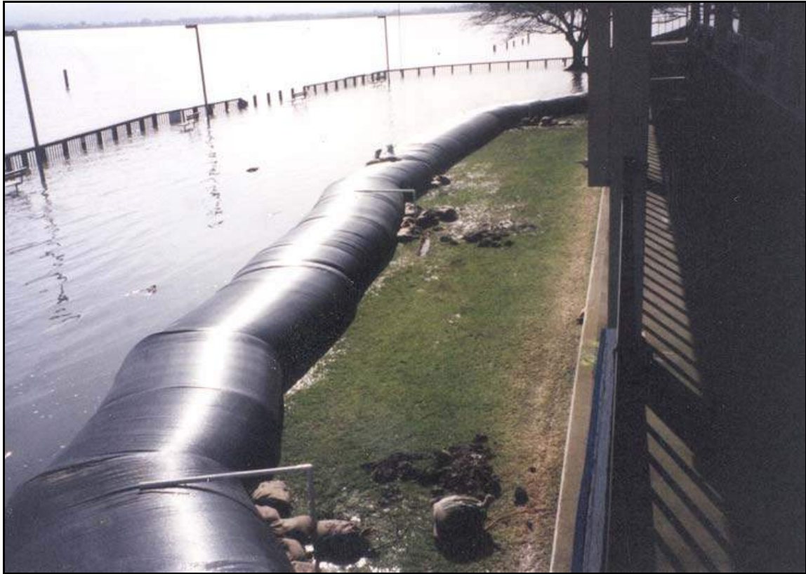
4' high AquaDams® used for flood protection of the Skylark Hotel in Clear Lake, CA.