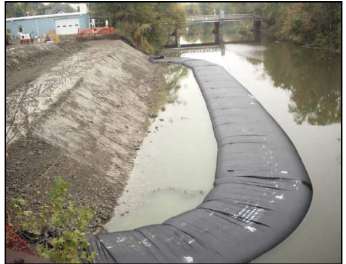
AquaDam® being used to isolate the Vermilion River from contaminants. Pontiac, IL.