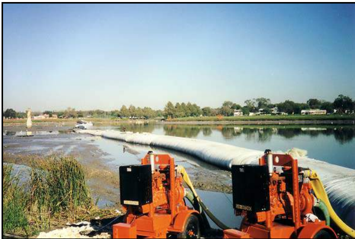
Woodlawn Lake. San Antonio, TX.