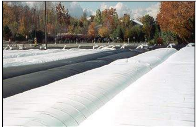
Another picture from SeaWorld Ohio.